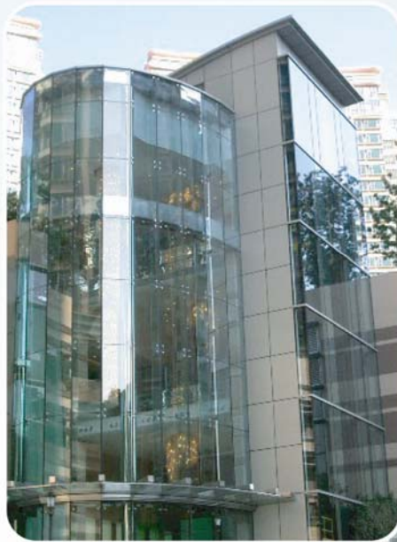
京士柏君頤峰 King's Park Parc Palais

Government, MTRC, KCRC, Airport & Hotel Projects