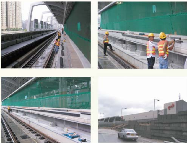
Rubber Fillets and Absorbent Strips of KCRC East Rail Extensions, H.K. 九廣鐵路東鐵各車站之月台空隙安全填縫膠及月台圍身防護避震膠